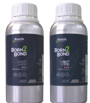
500g bottles for LIGHT LOCK MV & HV