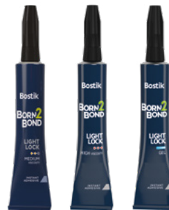
20g alu tubes for LIGHT LOCK MV, HV & Gel