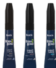
5g alu tubes for LIGHT LOCK MV, HV & Gel

The first odorless light-curing cyanoacrylate