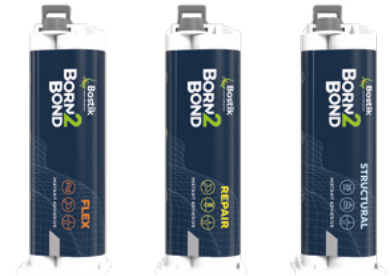
50g syringes for FLEX, REPAIR & STRUCTURAL